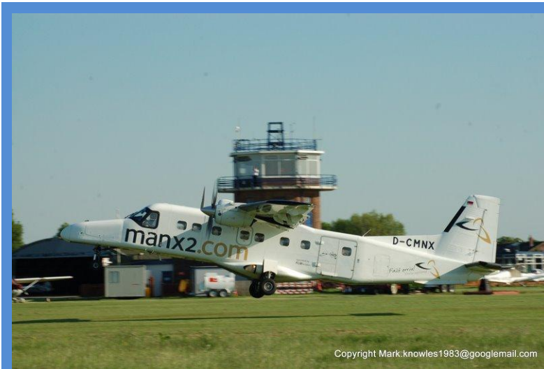
Dornier Do228 at City Airport